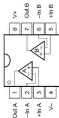
OPA pin define